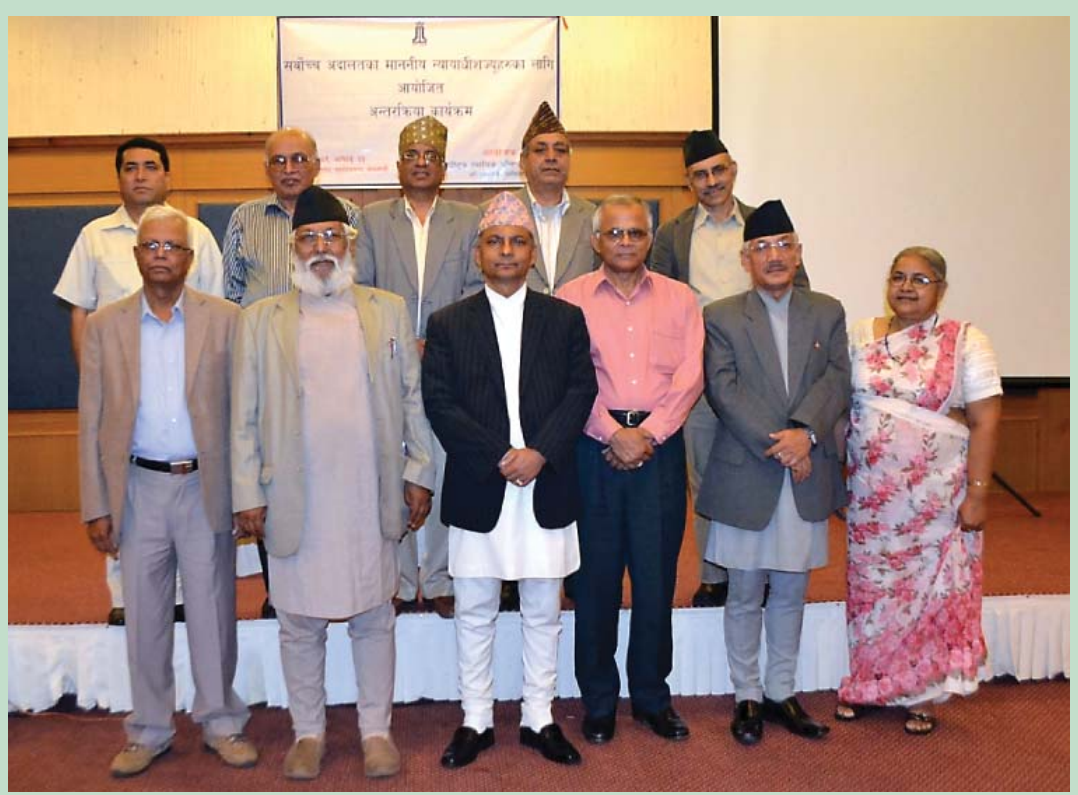
Right Honorable Chief Justice & Honorable Justices of Supreme Court of Nepal and Executive Director of NJA in the Retreat Program.