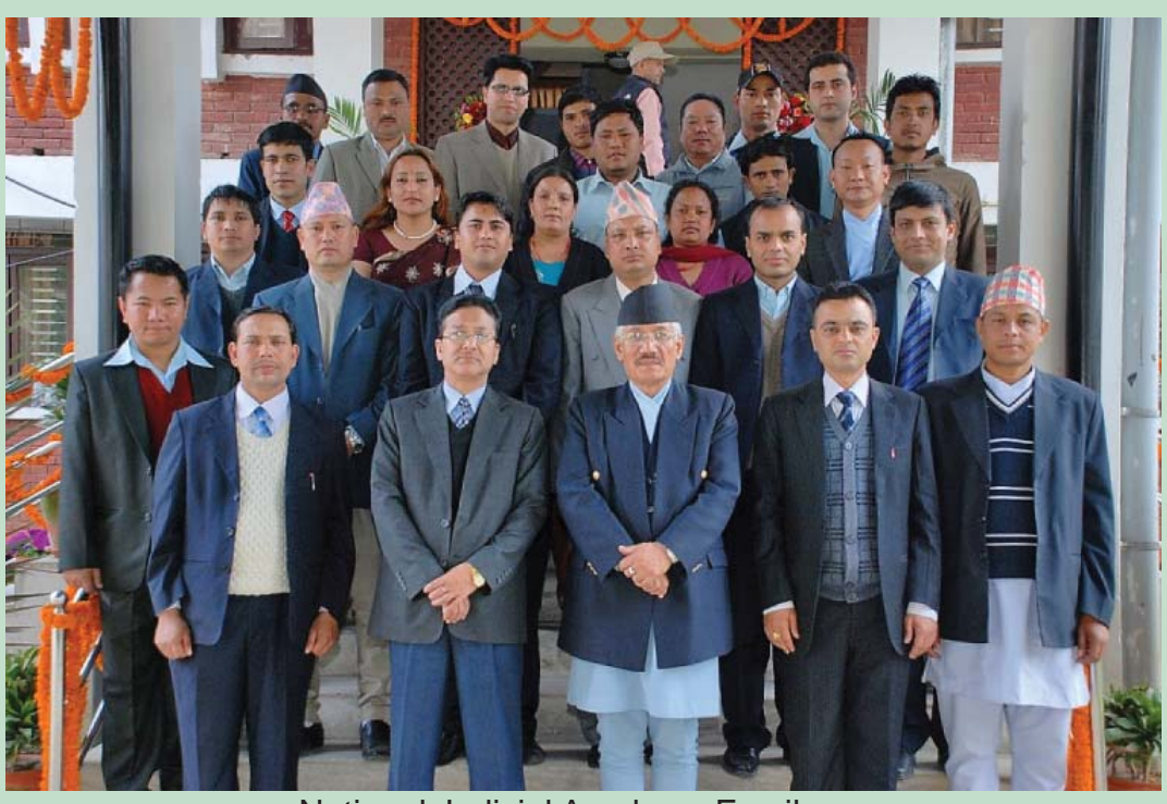
National Judicial Academy Family